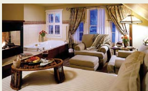
Sang Run Room