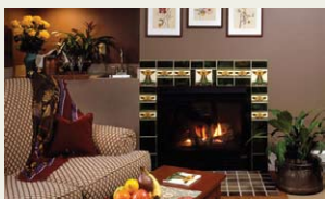
Buffalo Marsh Suite

Lake Pointe Inn offers 2 suites and 8 guest rooms. Rates range from $188 to $279 per night, and include a gourmet style breakfast with fresh squeezed orange juice. A continental breakfast is also offered for those hitting the slopes early or taking a mountain hike. Guests are always welcome to explore the snack room and kitchen, which are fully stocked with complimentary beverages, fresh baked goods, popcorn and fruits. Each guest floor has a beverage bar well stocked with hot and cold drinks - including wine, beer, soft drinks, juices, coffee, tea, hot chocolate, spiced cider and our own Garrett County's Deer Park water.