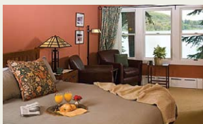
Sam Leff Room